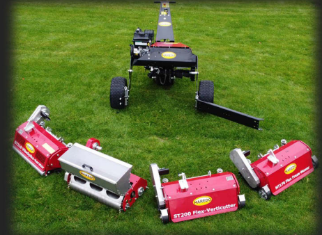
ST heads are easy to interchange

The rear wheels can be set at narrow position: behind the STrac . Or wide: beside the STrac , for optimal stability and short turning radius. Or choose a combination of both with one wheel behind and one wheel beside the STrac .