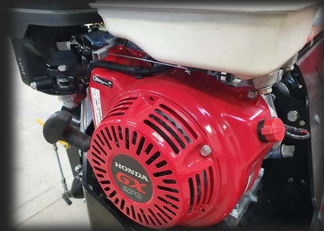
8.5 HP HONDA engine