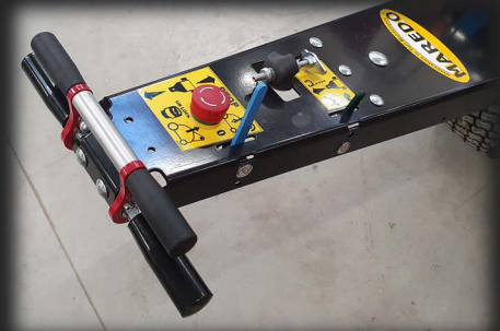
Easy accessible controls