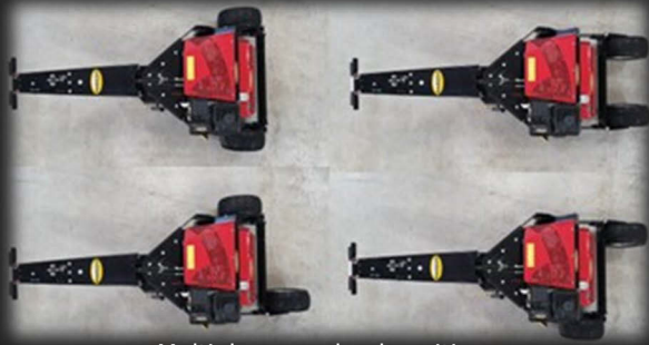
Multiple rear wheel positions